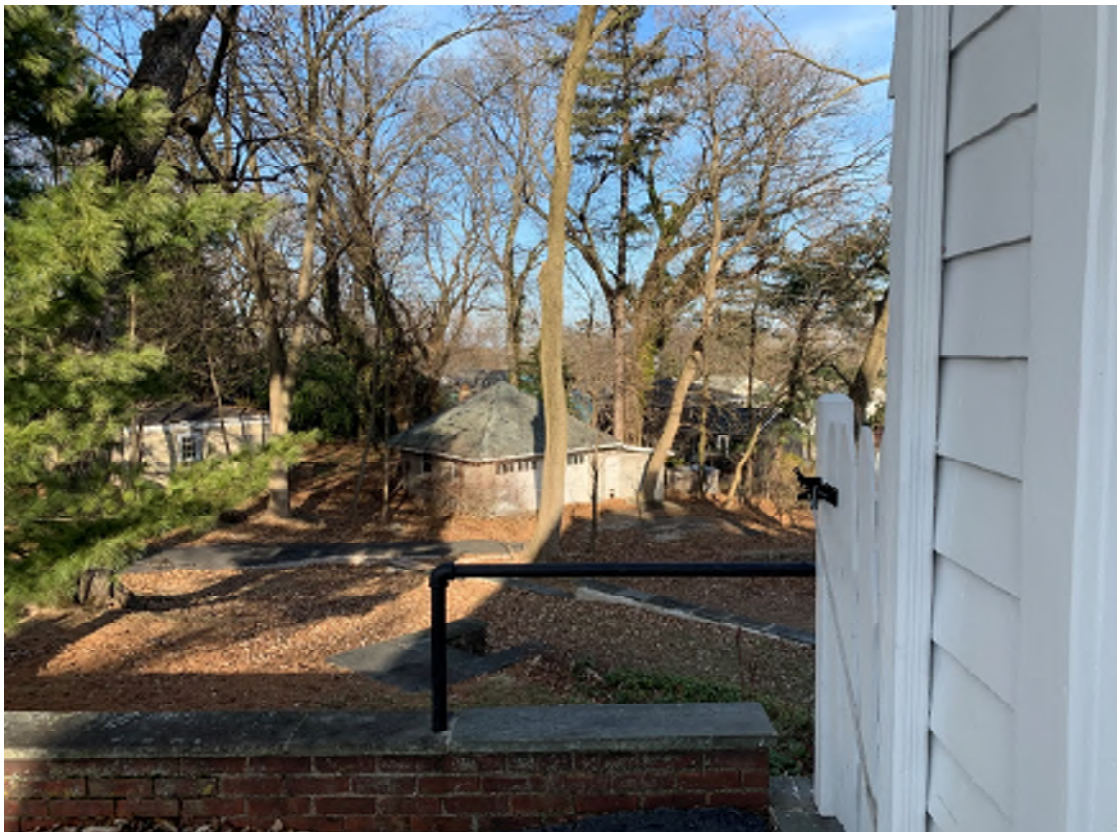
Photo#10 – Detached garage as viewed from attached garage at 509 Park Street, Montclair, New Jersey.