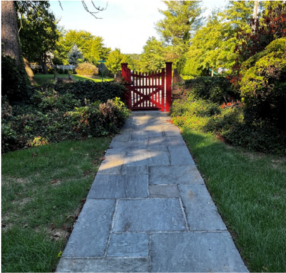
Photo#7 – Front gate as viewed from the entrance to 509 Park Street, Montclair, New Jersey.