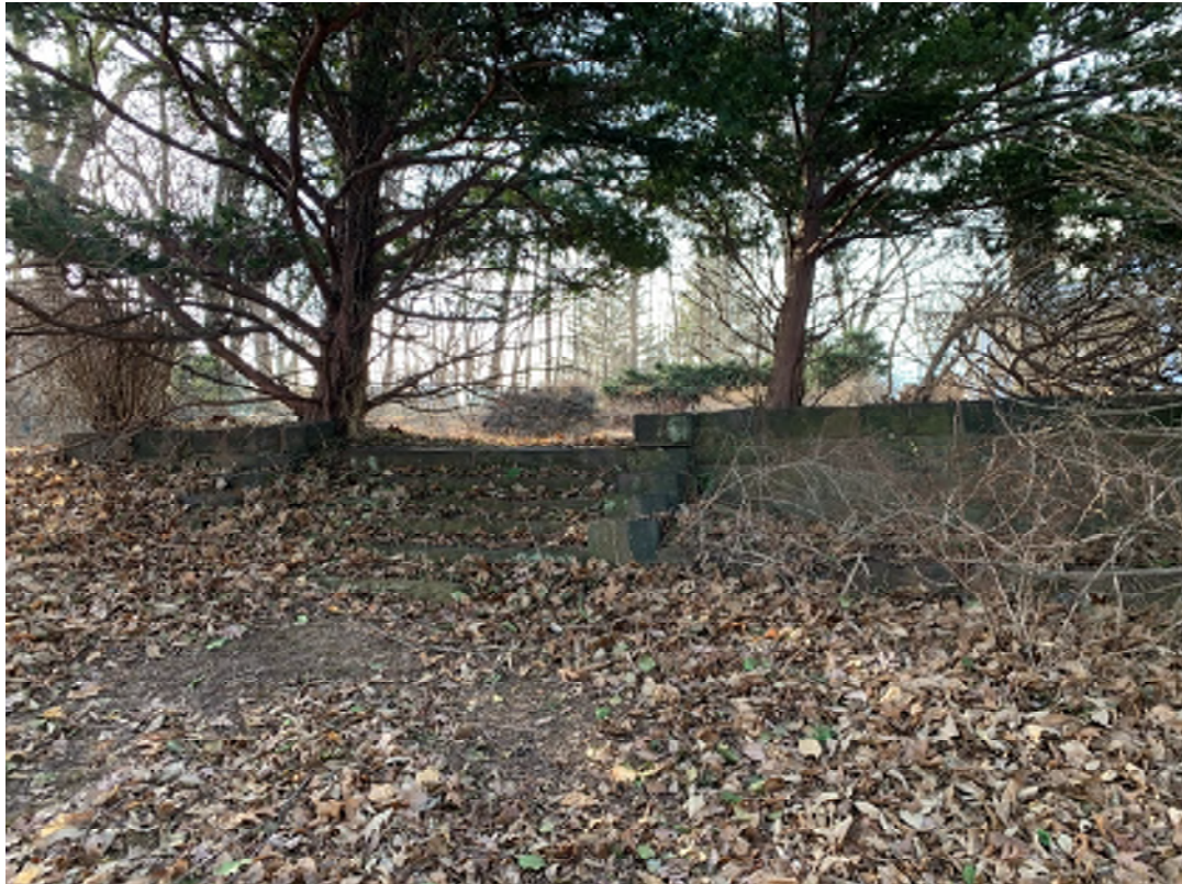
Photo#14 – Landscape feature found near rear of proposed lot 29.03 at 509 Park Street