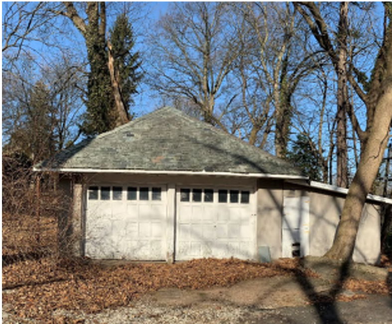
Photo#8 – Detached garage in rear corner of 509 Park Street, Montclair, New Jersey.