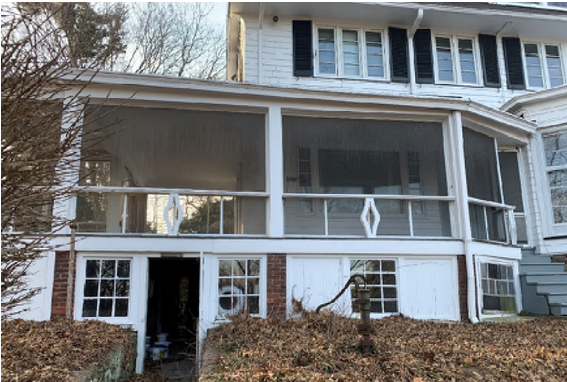
Photo#2 – Porch at rear of main dwelling at 509 Park Street in Montclair, New Jersey.