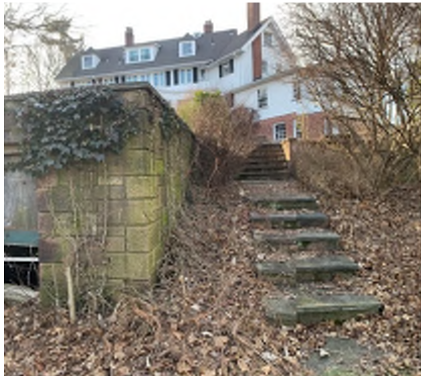
Photo#4 – Rear of 509 Park Street in Montclair, New Jersey from the lower lawn.