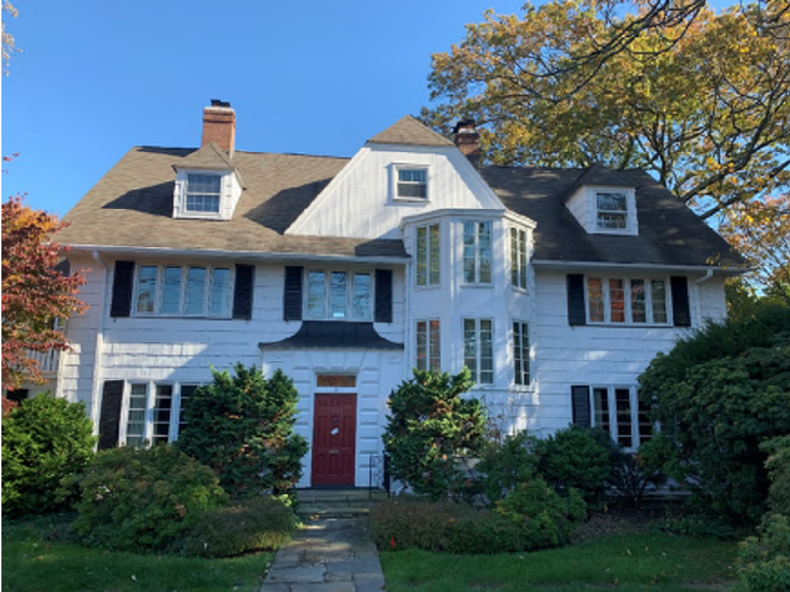
Photo#1 – Front façade of 509 Park Street in Montclair, New Jersey.