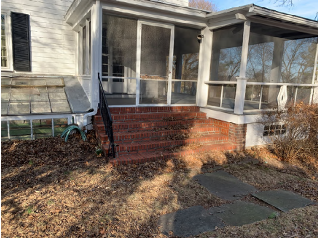
Photo#3 – Side entrance to 509 Park Street in Montclair, New Jersey.