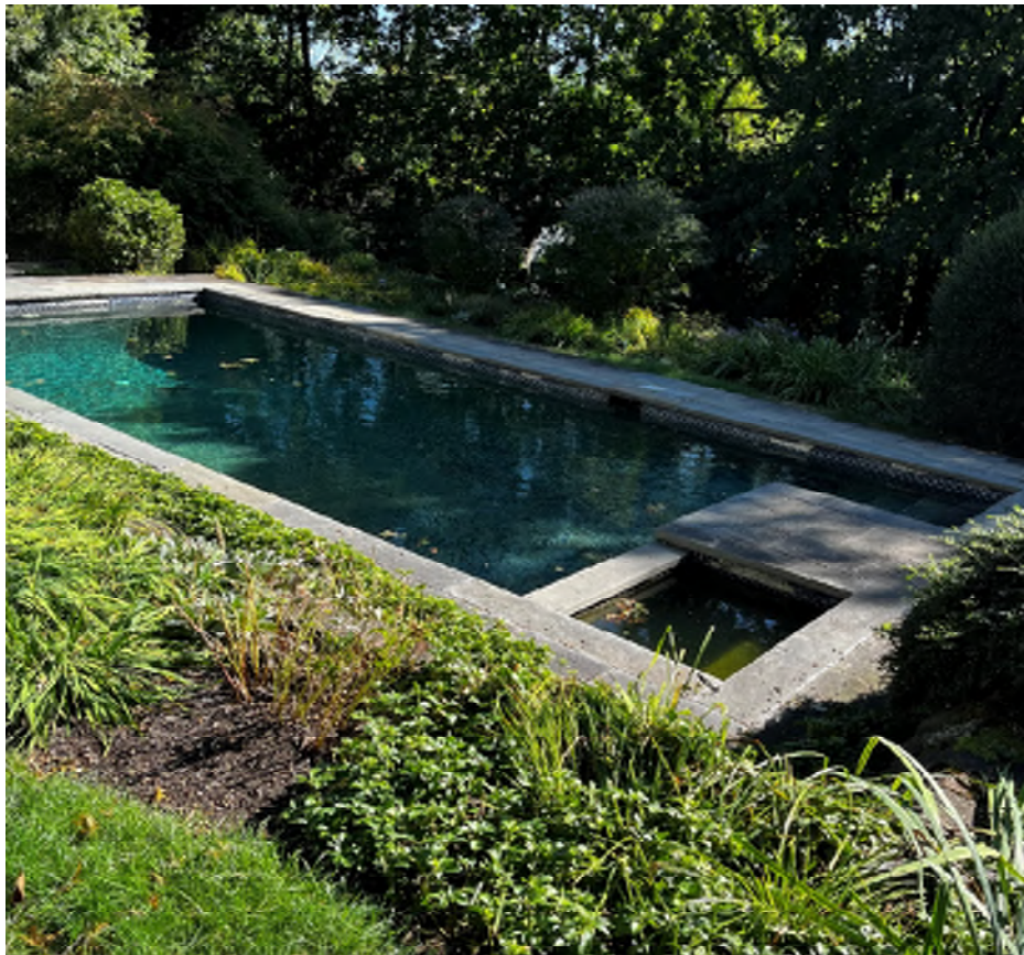
Photo#6 – Pool in rear yard of 509 Park Street, Montclair New Jersey.