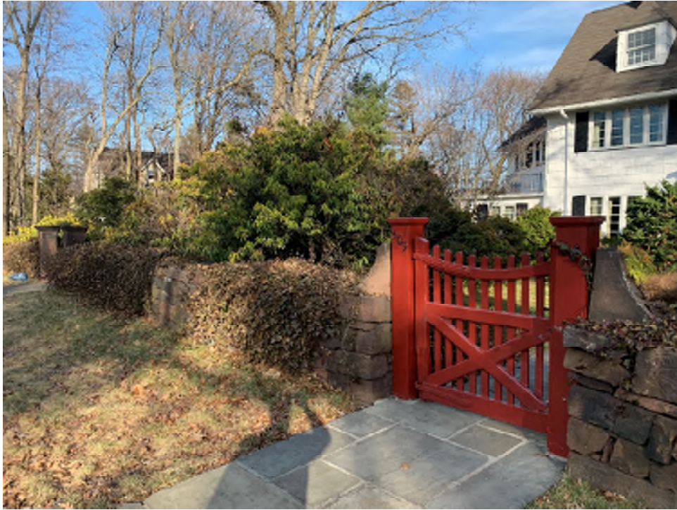
Photo#11 – View of gate and stone wall along street right-of-way ling of 509 Park Street, Montclair, New