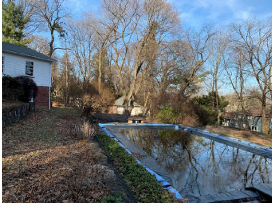
Photo#9 – View of pool and detached garage in rear of 509 Park Street, Montclair, New Jersey.