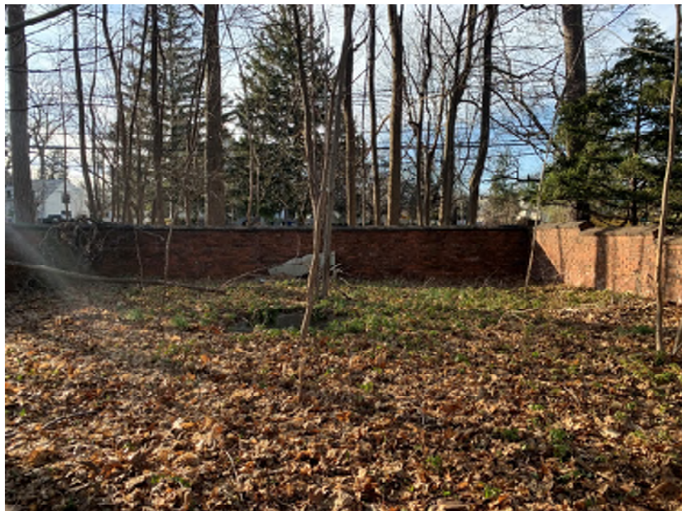
Photo#12 – Garden area on proposed lot 29.03 at 509 Park Street, Montclair, New Jersey.