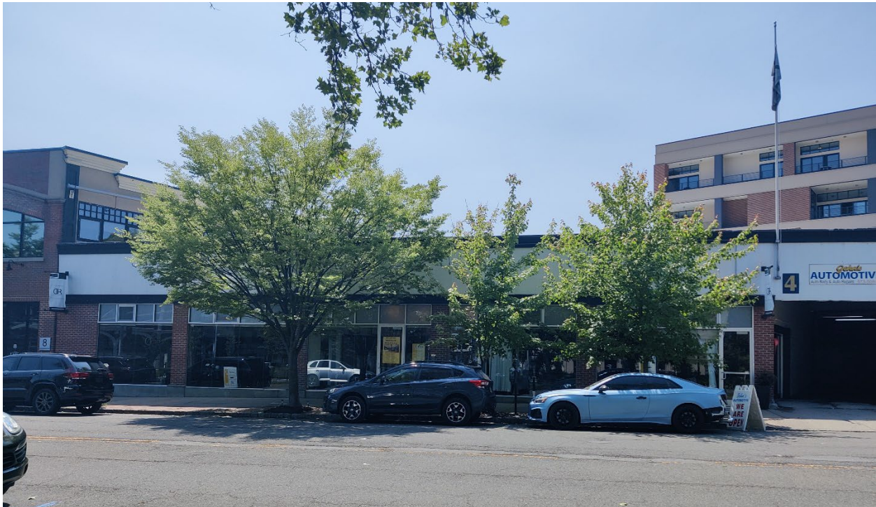
Figure 3: Gallery use in building at 4 Lackawanna Plaza.