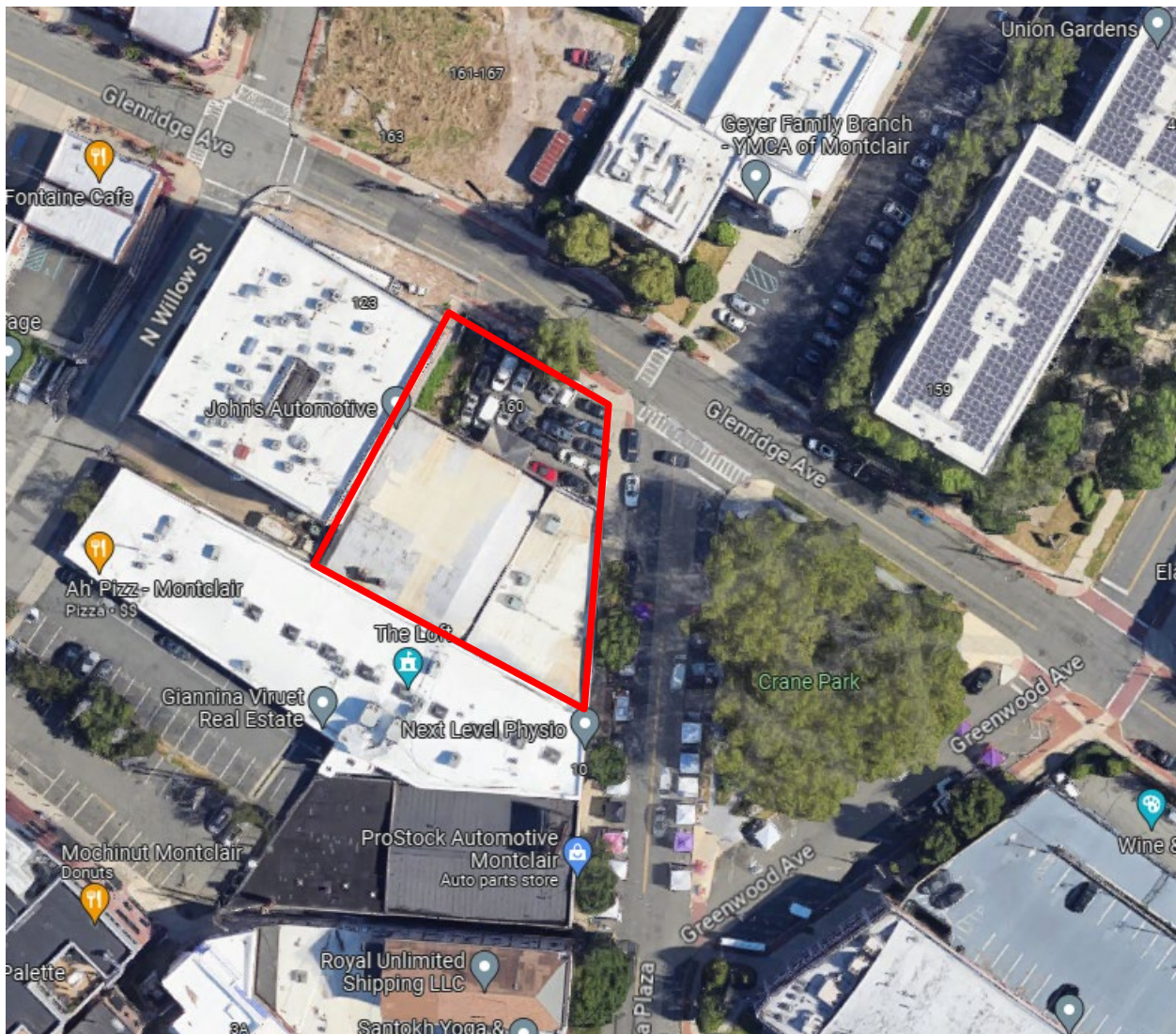
Figure 2: Aerial photo showing location of subject property.

A box culvert is located on the western side of the property. The culvert is open where it crosses Lot 13 and extends underneath the building on Lot 14. The culvert is filled with rocks and vegetation. No water was evident during the site visit. A concrete wall separates the culvert from the adjacent sidewalk.