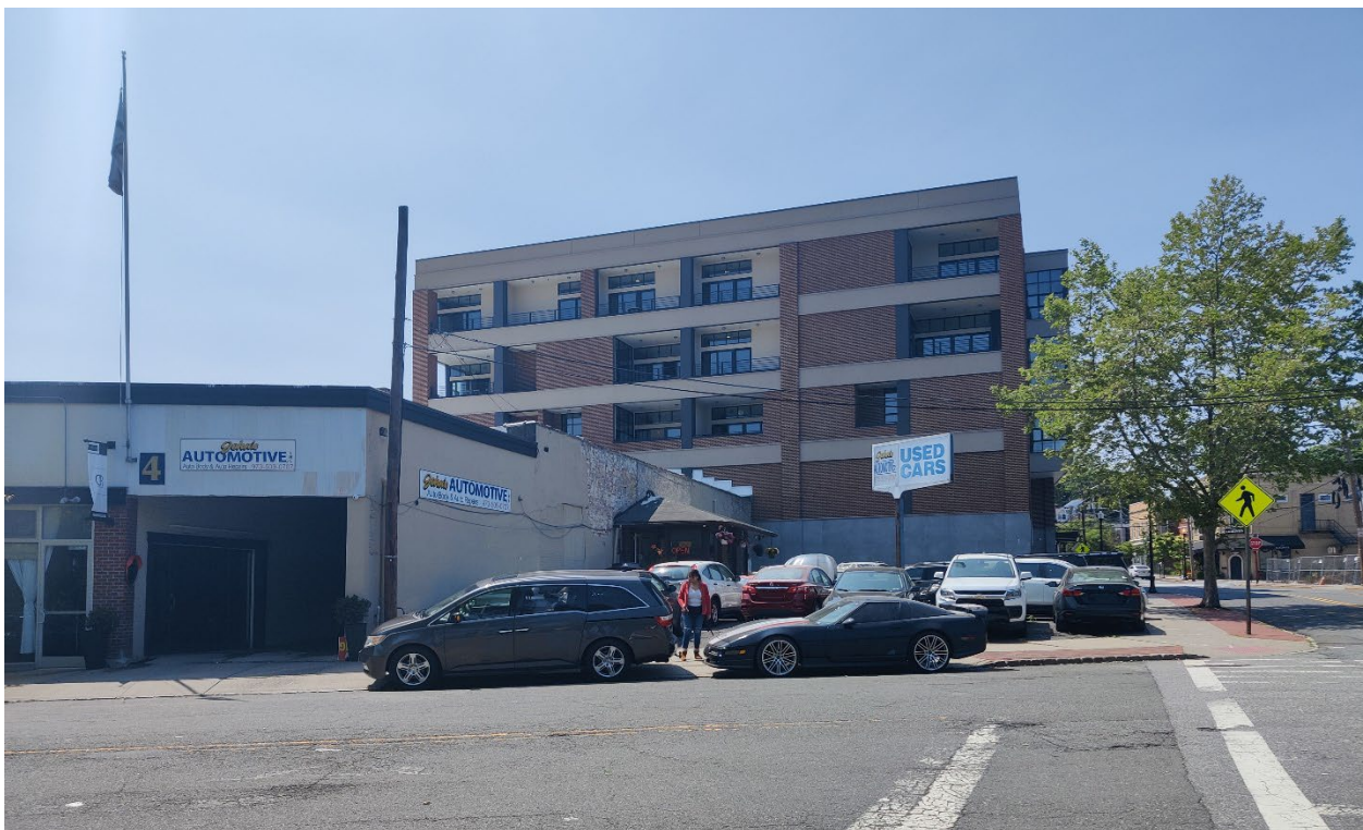
Figure 4: Automotive repair use at corner of property.