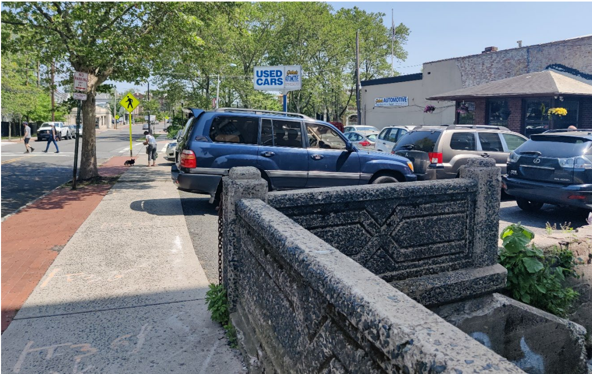
Figure 7: Car storage and open culvert along Glenridge Avenue, looking east.