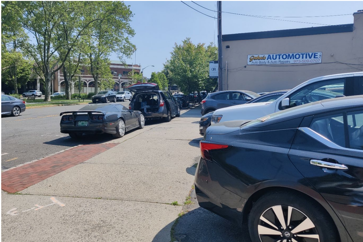
Figure 5: Car storage onsite and on street at driveway entrance on Lackawanna Plaza.