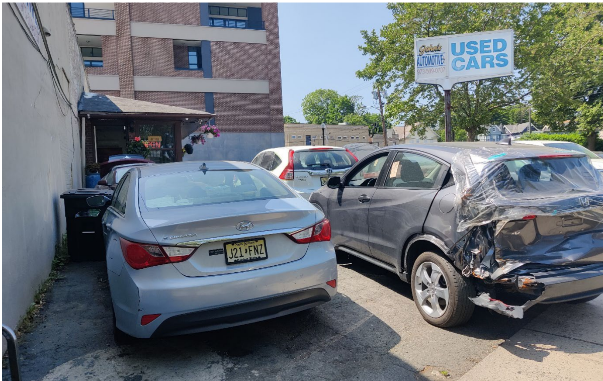
Figure 6: Car storage viewed from Lackawanna Plaza.