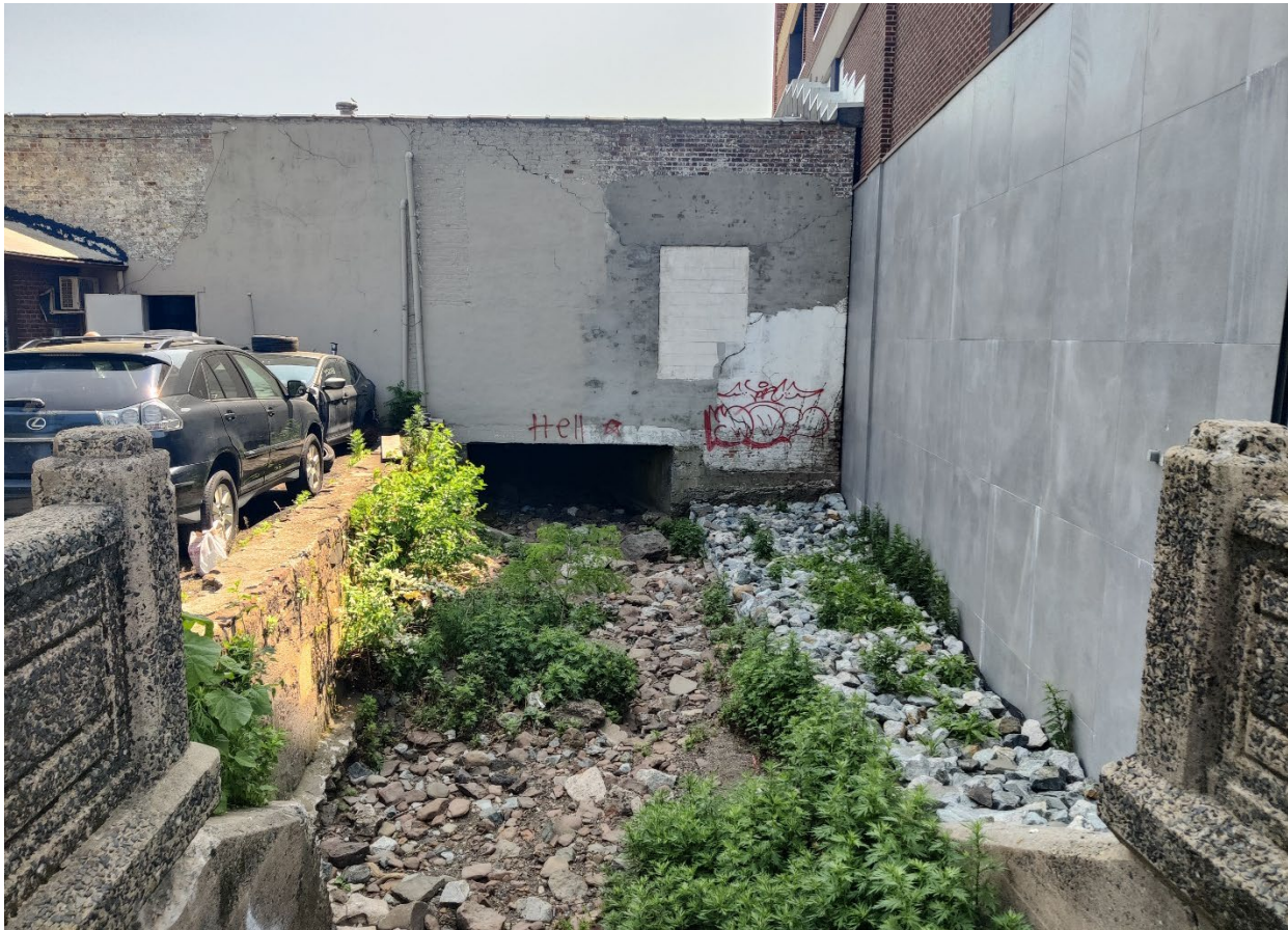
Figure 9: Open culvert that is proposed to be covered.