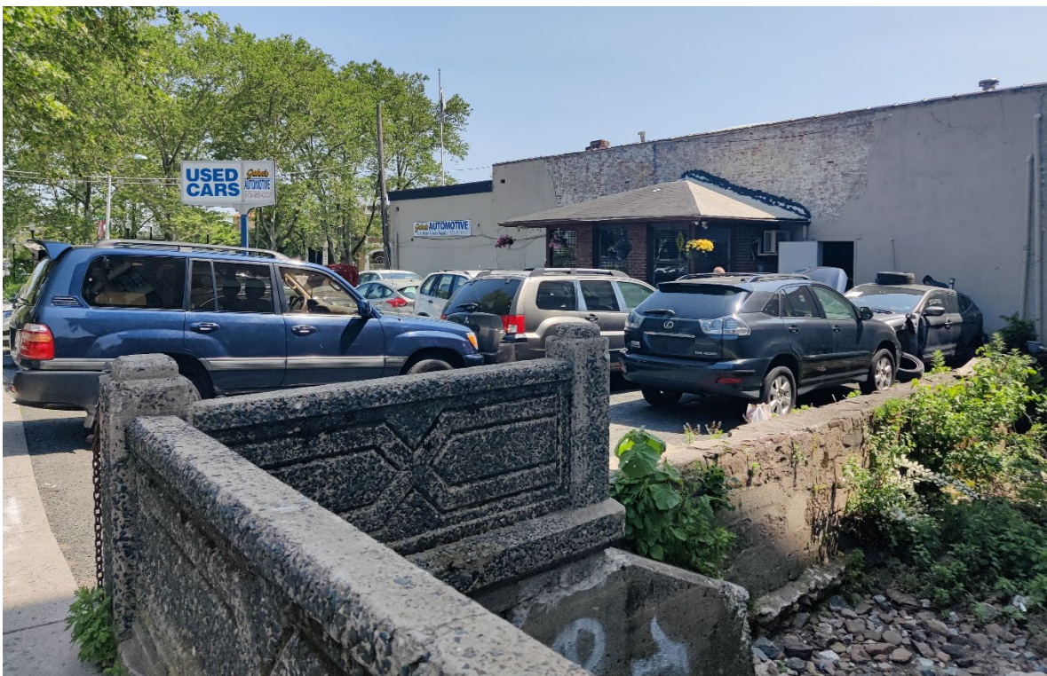
Figure 8: Car storage adjacent to open culvert.