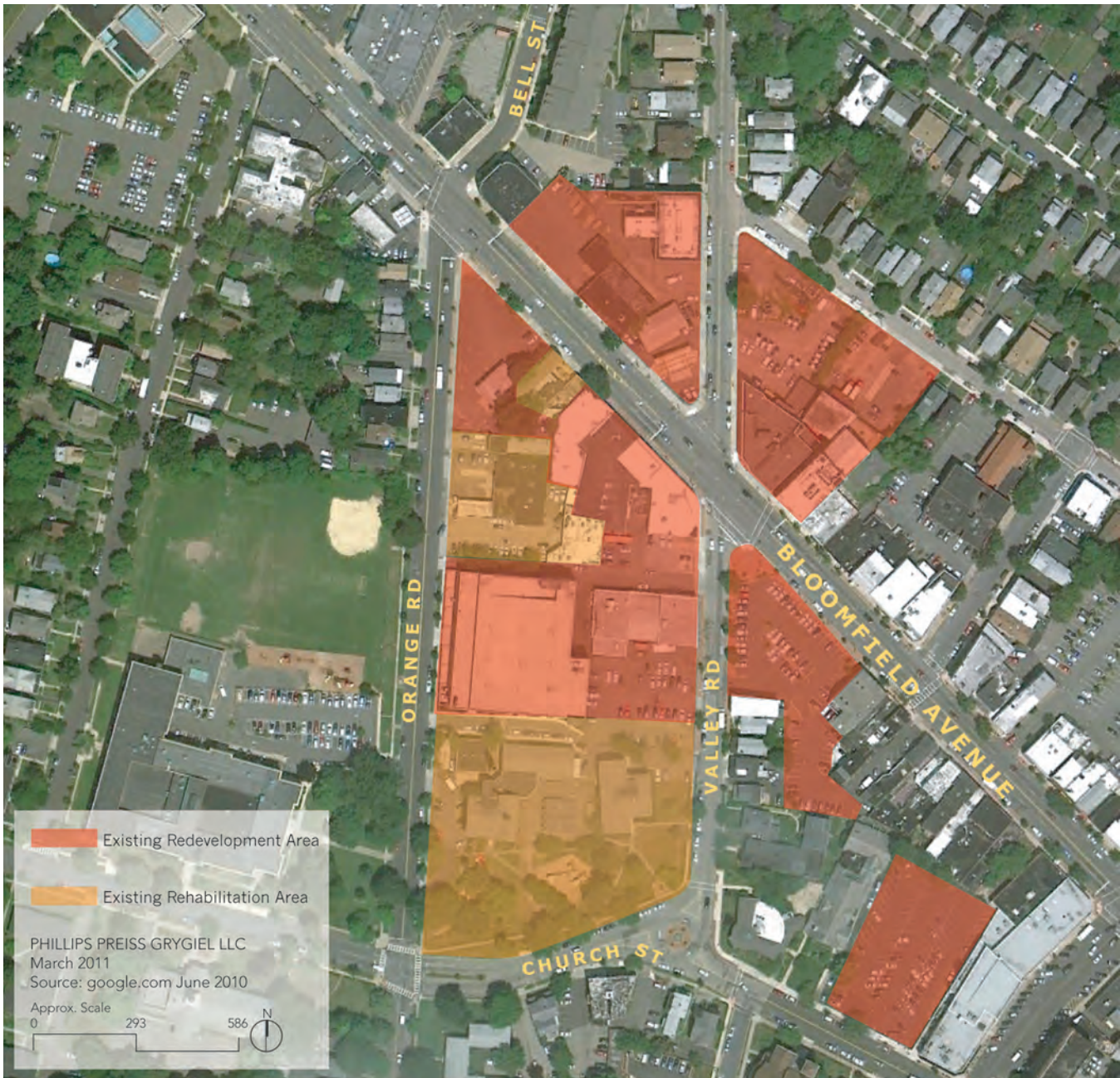
FIGURE 4: Location of Redevelopment and Rehabilitation Areas within the Gateway Area