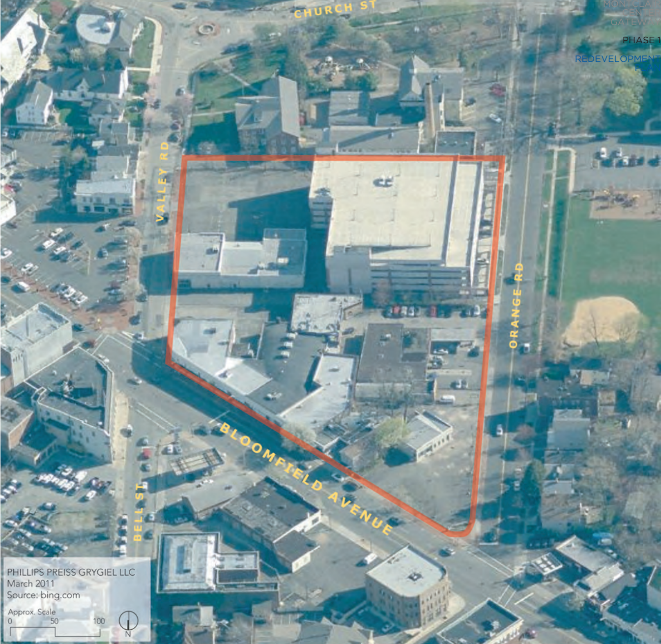
FIGURE 5: Aerial View of Plan Area and Surrounding Context