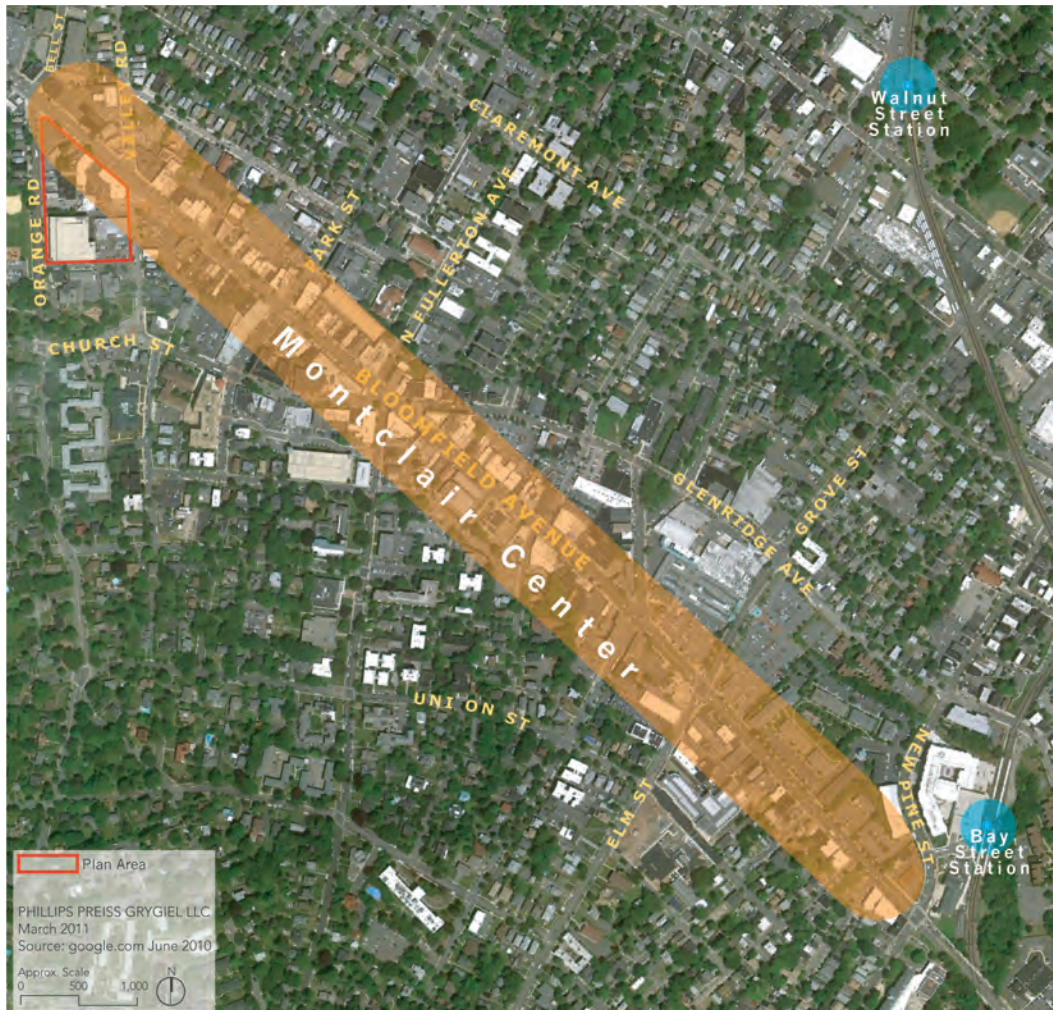
FIGURE 1: Location of Montclair Center Gateway

The properties addressed in this plan include six parcels which were designated an Area in Need of Rehabilitation in 2009 and one Township-owned parcel (Lot 18) which had been designated an Area in Need of Redevelopment in 2001 in addition to the aforementioned parcels designated as an Area in Need of Redevelopment in 2010. Figure 2 lists the tax parcels included in this Redevelopment Plan and notes the redevelopment/rehabilitation area status of each. The locations of these lots are illustrated in Figure 3.